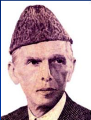
M. A. Jinnah, (Father of the nation)

‘Urdu and Urdu alone- shall be, will be and must be the state language of Pakistan’.