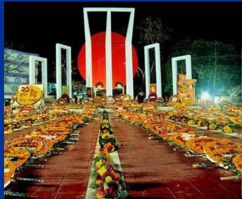
Central Shaheed Minar