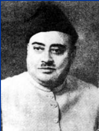
L. A. Khan, (Prime minister)

‘Provincial language could be decided by the province, but Urdu will be the state language of Pakistan’