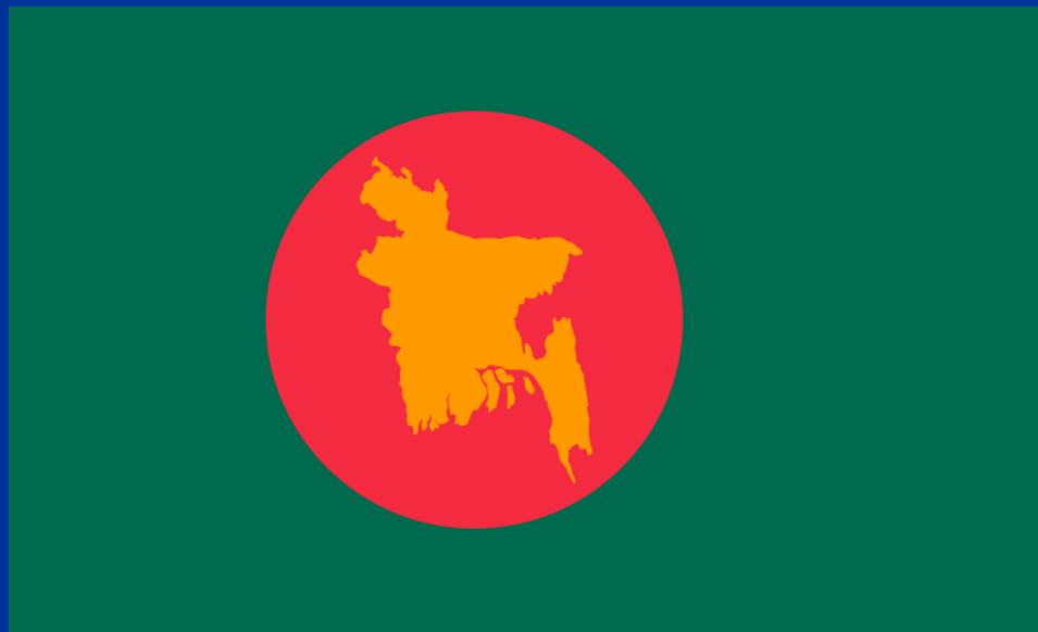
National Flag of Bangladesh